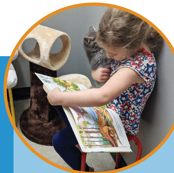
A Shelter Buddies Literacy Program for Kids participant enjoys reading out loud to improve her reading skills while also helping a shelter cat.

With our new Executive Director and energized Board of Directors we look forward to what we will accomplish in 2022 with the support of our Volunteers, Donors and Community.